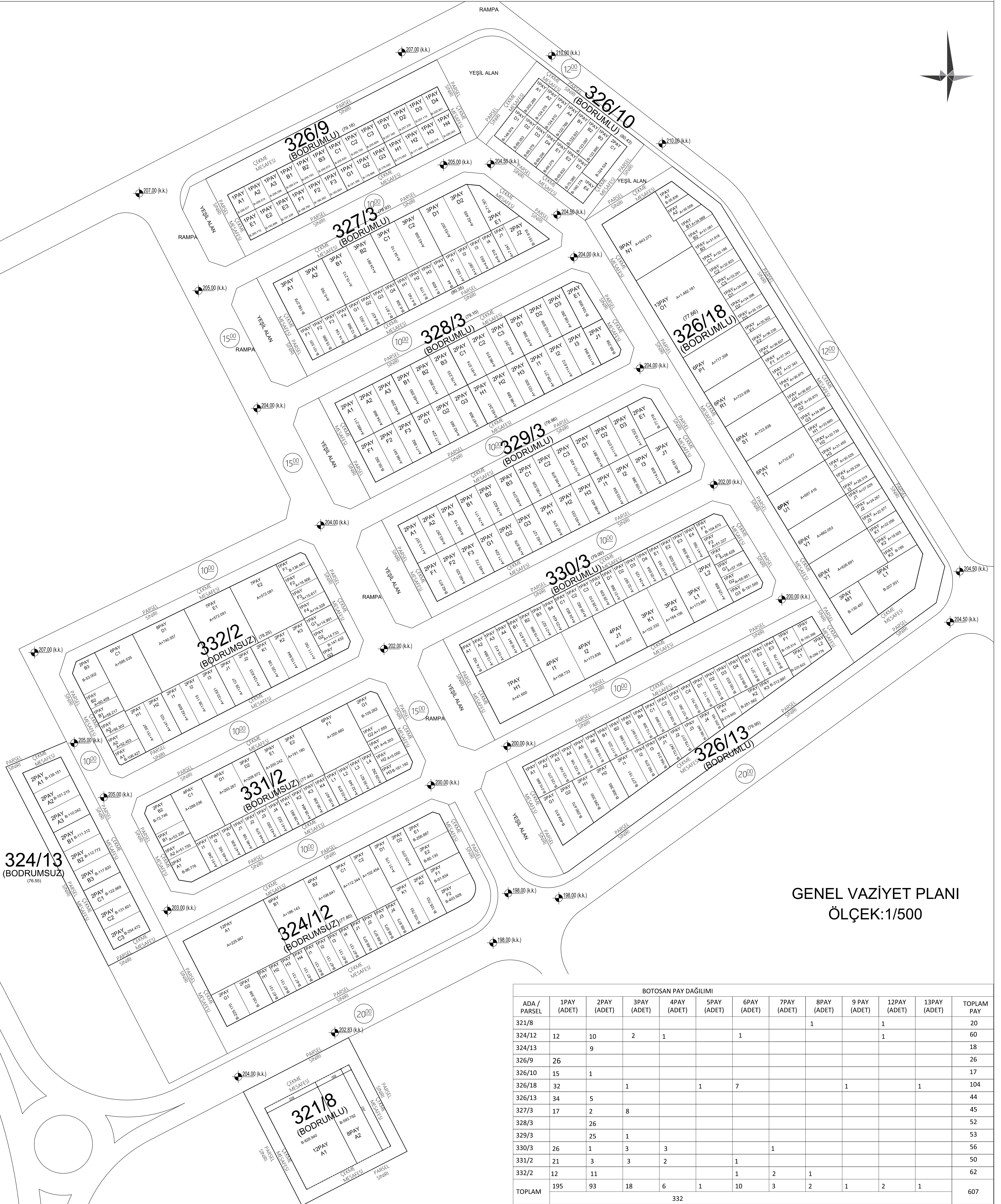
GENEL VAZİYET PLANI ÖLÇEK: 1/500